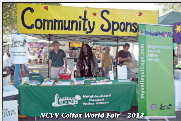
NCVV Colfax World Fair – 2013