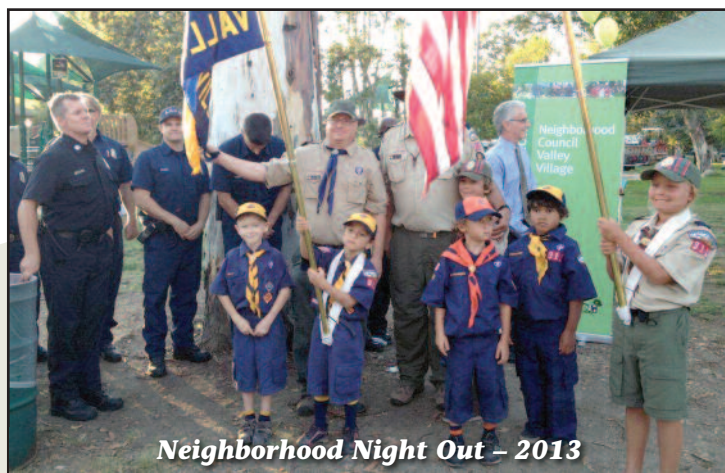
Neighborhood Night Out – 2013