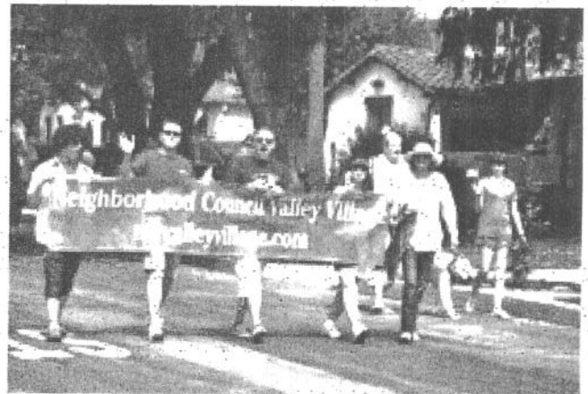
4 th of July Parade

If you wish to sign up for Neighborhood Watch or CERT, you can register on our website, myvalleyvillage.com or call our NCVV phone line at 818-759-8204. These programs can't realize their full potential if we don't have stakeholders participating. Tony