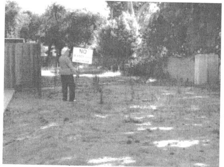
The 30 Foot Lot